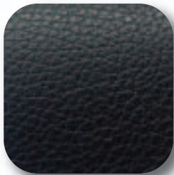
BLACK PALOMA #1022