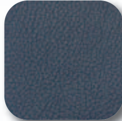
BLUE COW #300