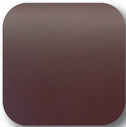
BROWN ELK LIGHT - #201 MEDIUM - #202 HEAVY - #203