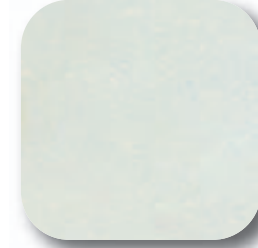
PEARL ELK 24-26 S.Q. FT. #172