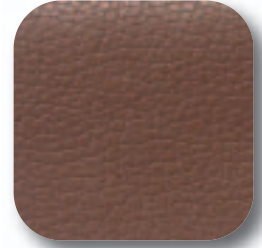
TAN SOFTY PEBBLE #170