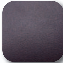
BLACK CHERRY VAQUERO #135