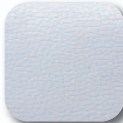
WHITE SOFTY PEBBLE #167