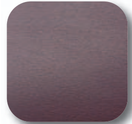
RUST VAQUERO #134