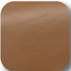
TAN LINING #130