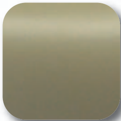
GREEN ELK MEDIUM - #1822 HEAVY - #1833