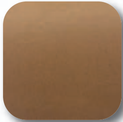
ROYO PULL UP COW #138

LEATHER, Cont. - All leather sales are final, no returns or exchanges.