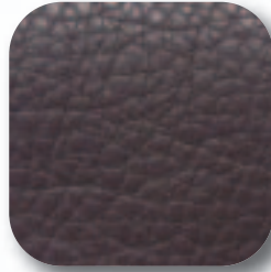
BROWN DEER COW #124