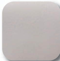
IVORY SABLE #147