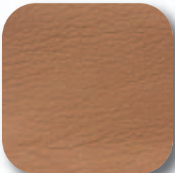
CREAM CABRETTE #307