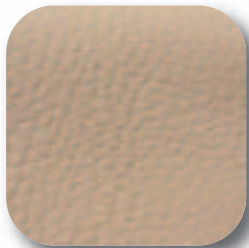
SAND DEER #308