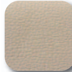
BONE SOFTY PEBBLE #165