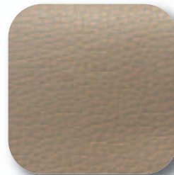
TAUPE SOFTY PEBBLE #169