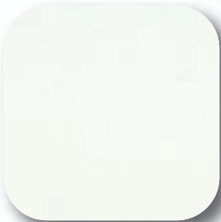
WHITE ATHLETIC #191A