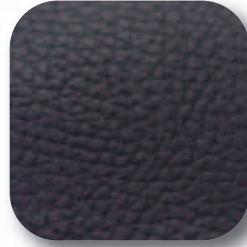
BLACK DEER SKIN #402