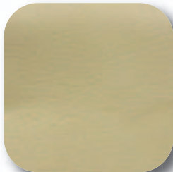
CREAM COW EXTRA LIGHT - #801 LIGHT - #802 MEDIUM - #803 HEAVY - #804

High quality, semi-aniline, top grain leather sold by the hide and has an average size of 18-22 square feet unless otherwise specified. All leather sales are final, no returns or exchanges.