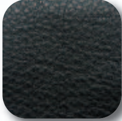
BLACK COW LIGHT - #297 MEDIUM - #198