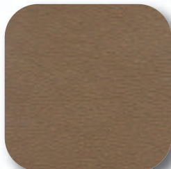
DARK BROWN CABRETTE #305