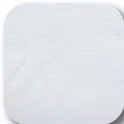
WHITE LAMB #1019