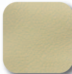
CLAY COW #200