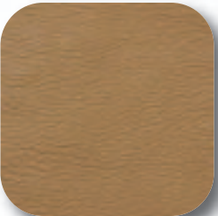
BEIGE CABRETTE #306