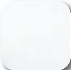
WHITE COW #195