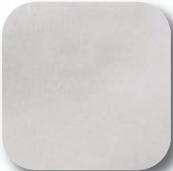
PEARL COW EXTRA LIGHT - #901 LIGHT - #902 MEDIUM - #903