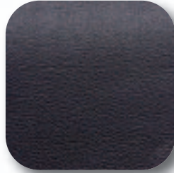
BLACK LUXOR #161