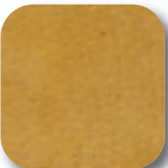
TAN PIG SUEDE #41