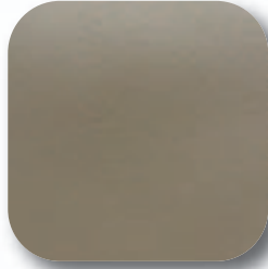
HONEY SABLE #146