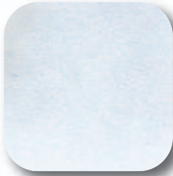
PEARL APRON SPLITS #1013

LEATHER, Cont. - All leather sales are final, no returns or exchanges.