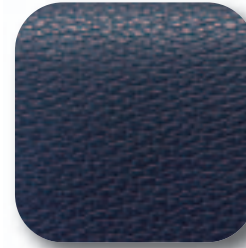
NAVY SOFTY PEBBLE #166