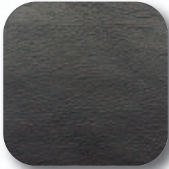
BROWN LAMB #1023

LEATHER, Cont. - All leather sales are final, no returns or exchanges.