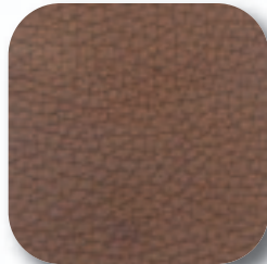
BROWN SADDLE SIDE #127