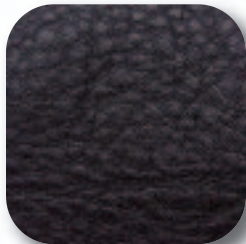
BROWN COW #197