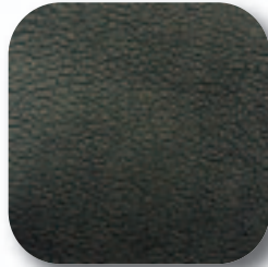
BLACK SHEEP #1021