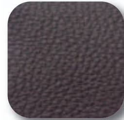
BROWN DEER #311