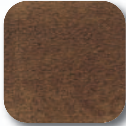
TAN FOOTBED #1017