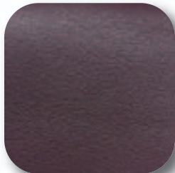
MAROON COW #299