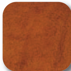
TOBACCO SUEDE #1015