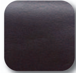
BROWN LUXOR #162