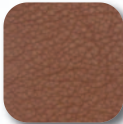
CARAMEL DEER COW #125