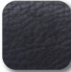
BLACK SADDLE SIDE #128