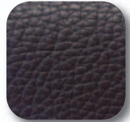
BROWN PEBBLE #205