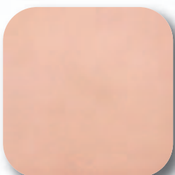
MOLDING 8-12 S.Q. FT. 5/6 OZ. - #154 8/9 OZ. - #157