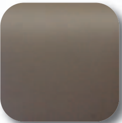
SMOKED ELK LIGHT - #181 MEDIUM - #182 HEAVY - #183