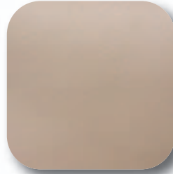
BONE LUXOR #164