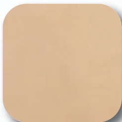
ENGLISH KIPS 6-8 S.Q. FT. #12