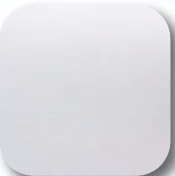
WHITE ELK LIGHT - #191 MEDIUM - #192 HEAVY - #193