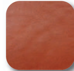
RUSSET 8-12 S.Q. FT. 4/5 OZ. - #703 5/6 OZ. - #704 8/9 OZ. - #707