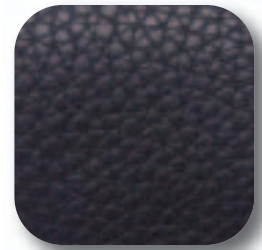
BLACK DEER COW #123