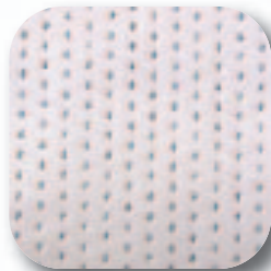
PERFORATED PEARL COW LIGHT - #902P